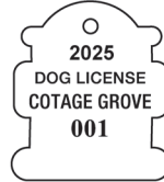
Style No. 53