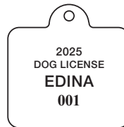
Style No. 23