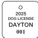
Style No. 85