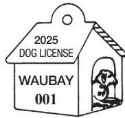
Style No. 20