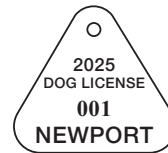
Style No. 97