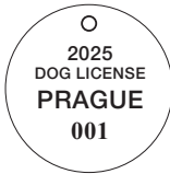
Style No. 25