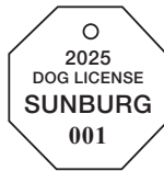
Style No. 36