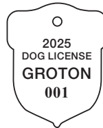
Style No. 93