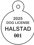
Style No. 21