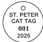
Style No. 57