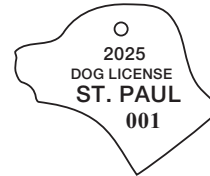
Style No. 55