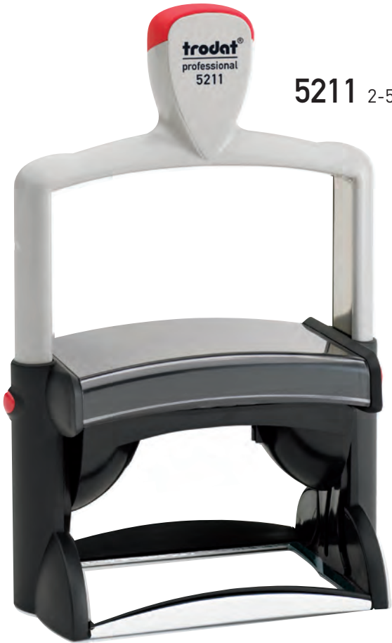
5211 2-5/32" x 3-5/16"

Reviewed for general arrangement and general conformance with contract documents, accuracy of all dimensions, details suitability of products shown hereon for purposes described in contract documents, and for information that pertains solely to the fabrication process or techniques of construction. No term or condition of the contract document is waived, and no change is accepted, by use of this stamp