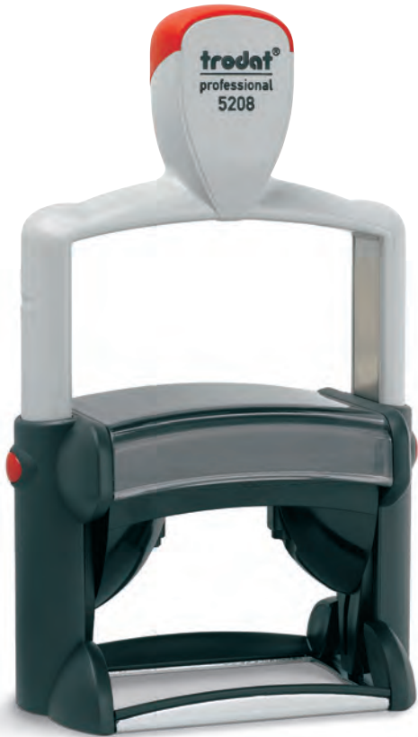
5208 2" x 2-3/4"