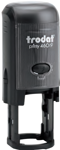
46019 3/4" with protective cap