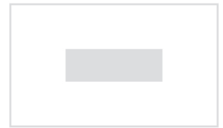
• Rectangular Dater